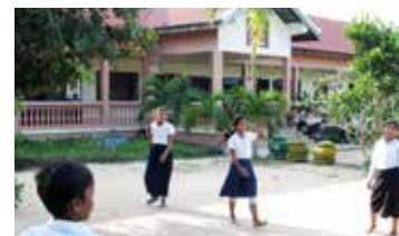
Secondary school will change their lives

new secondary school, the number of enrolments has gone up 30 per cent, from 305 to 400.