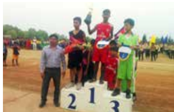
Well done for the basketball gold medal at Siem Reap (primary section) – and good luck for the national competition!

Your donation will help us help these communities