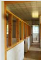
An office for each teacher