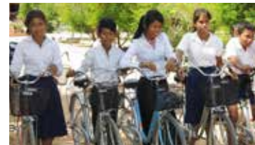
80 new bikes for kids living far away