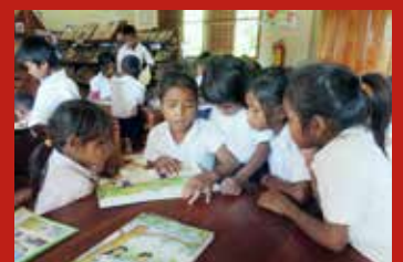
Two hours of reading each week

children read out their fairy tales, adventure stories and books on general knowledge and the environment. It's a treasure trove of awareness for these 400 children of the forest, made possible by generous donors in Geneva.