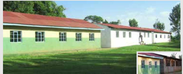
All classrooms in Kakemer School have been renovated