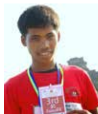
No. 3 at the Angkor Marathon