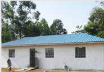
The admin block will open in March 2015

St. Luke's will soon have its own dormitory, to make life easier for the handicapped children and their families. The project will be financed by the Teso North Constituency – an important local investment in special needs care.