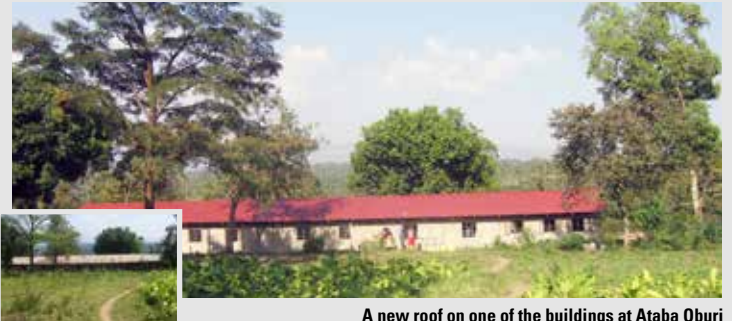
A new roof on one of the buildings at Ataba Oburi