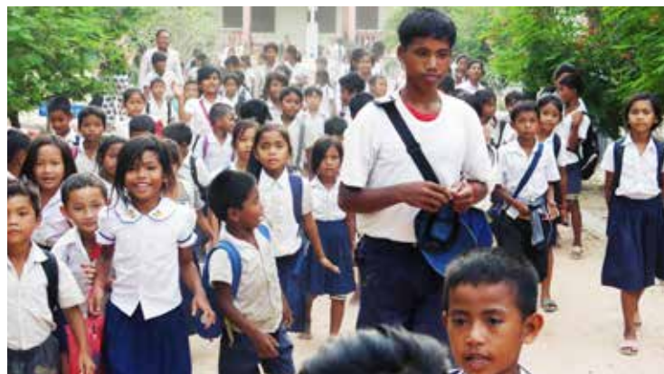
Ta Pen school's 400 children on a school outing

This massive increase has had an impact on costs, which have also been affected by the steep rise in staff salaries awarded in 2014 by the Ministry of Education. This is no doubt good news for the teachers but it adds to the challenges faced by Don du Chœur in running the school.